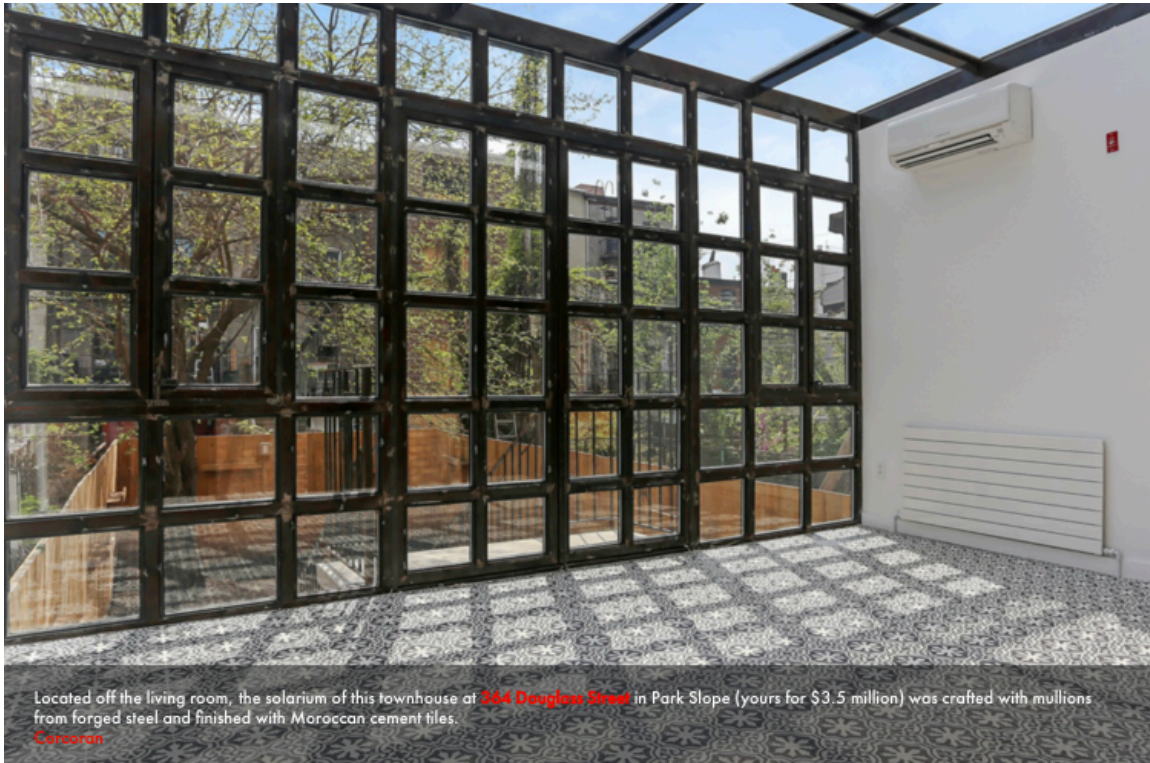
Located off the living room, the solarium of this townhouse at 344 Douglas Street in Park Slope (yours for $3.5 million) was crafted with mullions from forged steel and finished with Moroccan cement tiles. Corcoran

A glass-enclosed space from which to enjoy the sun, moon and sky— no matter the time of year or weather